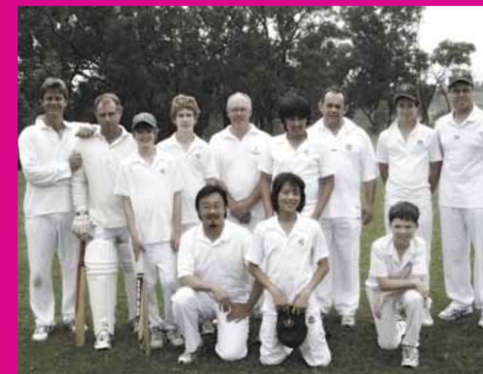
ELTHAM Collegian Cricket Club Father-Son-Grandfather Team