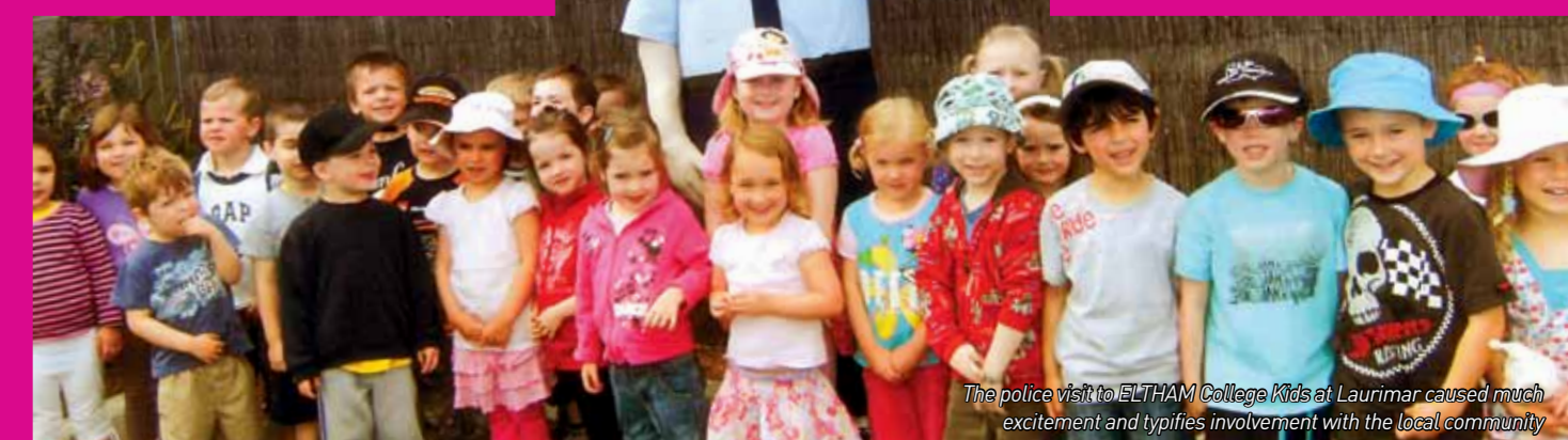
The police visit to ELTHAM College Kids at Laurimar caused much excitement and typifies involvement with the local community.

The $400 raised from the event will go towards the centre's sustainability project, helping to purchase items such as water tanks, worm farms, compost bins and to build a vegetable patch.